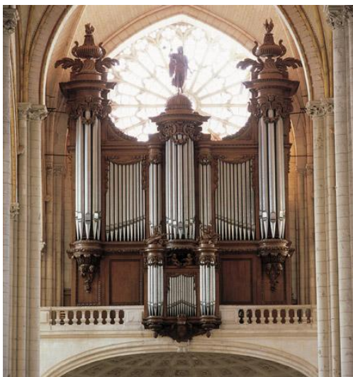
The François-Henri Clicquot organ of Saint Pierre Cathedral