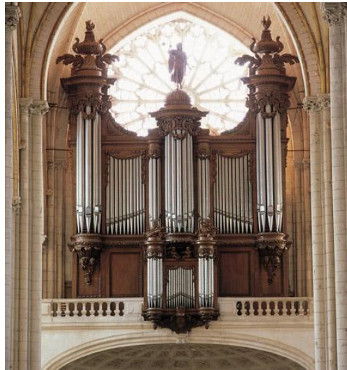
The François-Henri Clicquot organ of Saint Pierre Cathedral